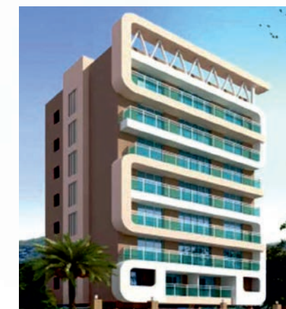
Spring Shelter Malad (W), Mumbai