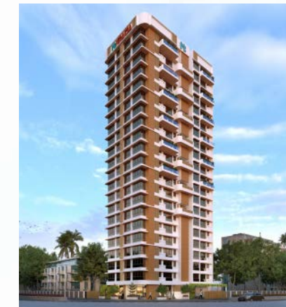
MK Gracia Andheri (W), Mumbai