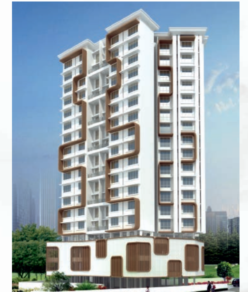
MK Gardenia Andheri (W), Mumbai