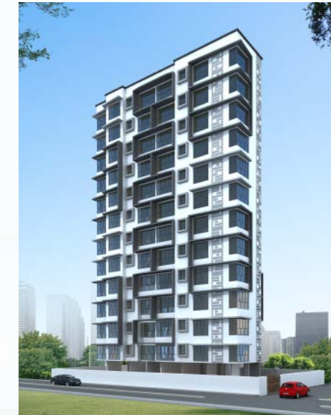
Art Cottage C.H.S. Andheri (W), Mumbai