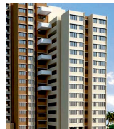
Om Sai SRA CHS Ltd Andheri (W), Mumbai